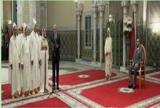
"Swearing in of new members of the Court before the King"