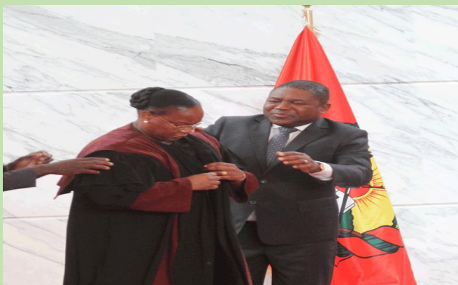
"Ms. Lucia Da Luz Ribeiro, President of the Constitutional Council of Mozambique"

The CJCA is organizing its 3 rd International Symposium in Maputo-Mozambique from August 10 to 12, 2020, on the theme "Electoral justice: transparency, inclusion and process integrity" , the CJCA is holding a Symposium between two Congresses. The first took place in Cotonou in 2013 on the theme: "The constitutional judge and political power" . The second took place in Algiers in 2017 on the theme of "Access by individuals to constitutional justice" .