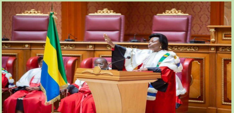
Ms. Marie-Madeleine Mborantsuo, President of the Constitutional Court of Gabon

The holding of this Meeting will coincide with World women's day celebration.