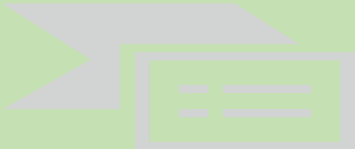
"Side of the Conference headquarters in Algiers"

The CCJA currently has forty-six (46) African constitutional court members, and (3) three non-African "observer members" , namely: Brazil, Russia and Turkey .