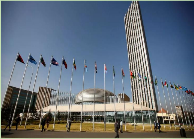
"Headquarters of the African Union in Addis"

The President of the CJCA will make a working visit to the headquarters of the African Union in Addis during the last quarter of 2020 to meet the Commissioner for political affairs and the Legal Counsel, also, he will be received by the President of the African Union.