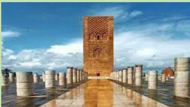
"Hassan Tower, Rabat"

The 6 th High level Congress of the CJCA will be held from April 4 to 7, 2021 in the cities of Rabat and Fez in Morocco, on the theme: "Constitutional Courts and International Law"